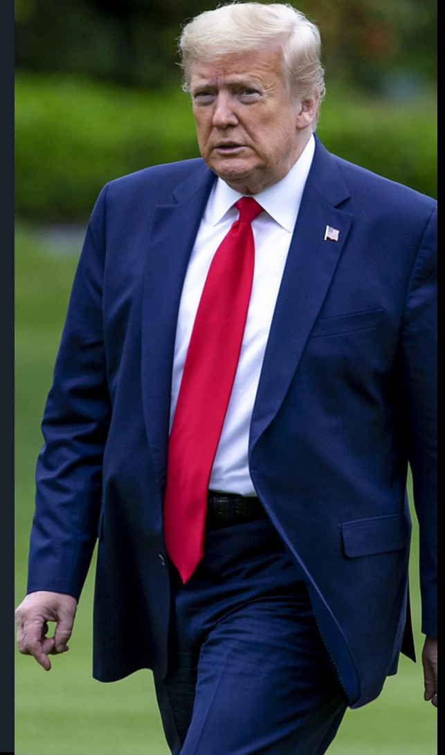
President Trump 2016-20